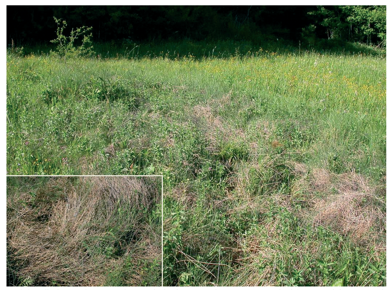
Fig. 8. A small calcareous fen near Niedzica was the first known site of Pupilla alpicola in Poland. Successional changes towards more productive Junco inflexi-Menthetum longifoliae vegetation (a detailed view in the left bottom corner) are currently threatening survival of this population.