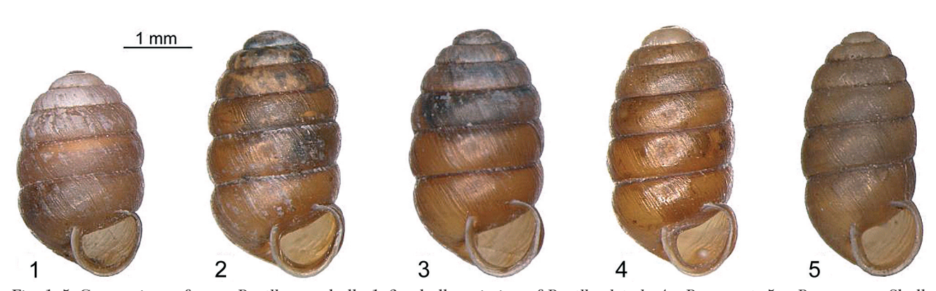
Figs 1–5. Comparison of some Pupilla spp. shells: 1–3 – shells variation of Pupilla alpicola ; 4 – P. pratensis ; 5 – P. muscorum . Shell measurements are in millimetres (high/width). 1 – Niedzica (Poland), 2.95/1.82, (M. HORSÁK lgt., April 2004); 2 – Baligówka (Poland), 3.61/1.93, (see Table 1B); 3 – Blatnica (Slovakia), 3.60/1.94, (M. HORSÁK lgt., September 2001); 4 – Rowele, 3.63/1.85, (see Table 1C), 5 – Brno (Czech Republic); 3.62/1.71, (M. HORSÁK lgt., October 1997). For details about species identification characters see VON PROSCHWITZ et al. (2009) and HORSÁK et al. (2010)