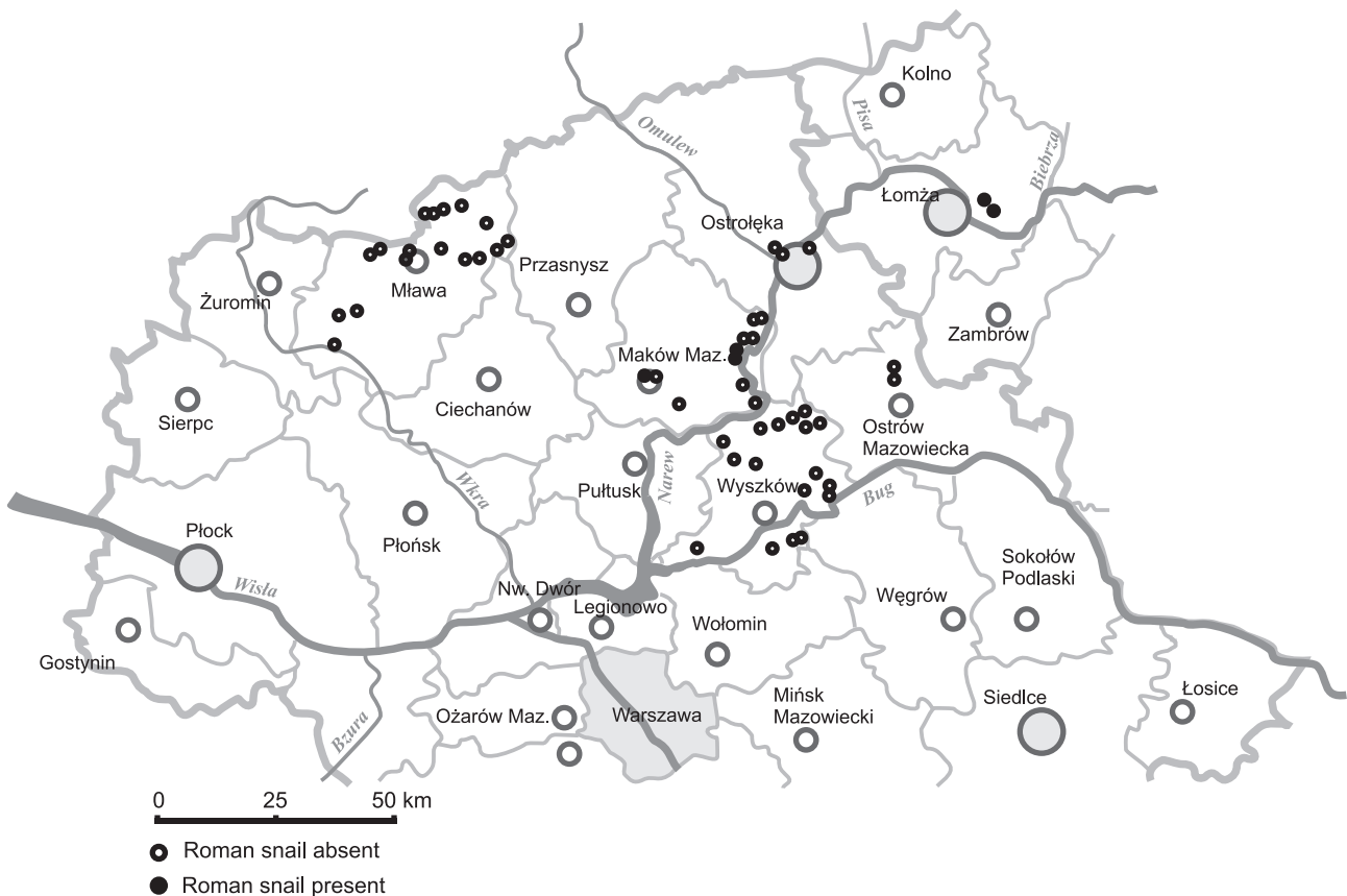
Fig. 1. Occurrence of Roman snail in the northern part of Mazovia

size and topography, from one plot (ca. 150 m 2 ). The plot size was determined during preliminary studies in Lasek Bielański in Warsaw, assuming a plot where 2–30 snails could be collected as satisfactory (KALINOWSKA 1981). The collected snails were cleaned with filter paper, counted, their maturity was estimated based on the presence of lip, their whorls were counted and the shell height, width and the so called “diameter” were measured (STĘPCZAK 1982) with electronic caliper to the nearest 0.1 mm; they were weighed with electronic balance to the nearest 0.01 g; the size structure of the population was assessed, as well as density and biomass per 100 m 2 . The total abundance and biomass of the studied populations were also estimated, as well as the size of the area inhabited by the species in the whole of Mazovian voivodeship.