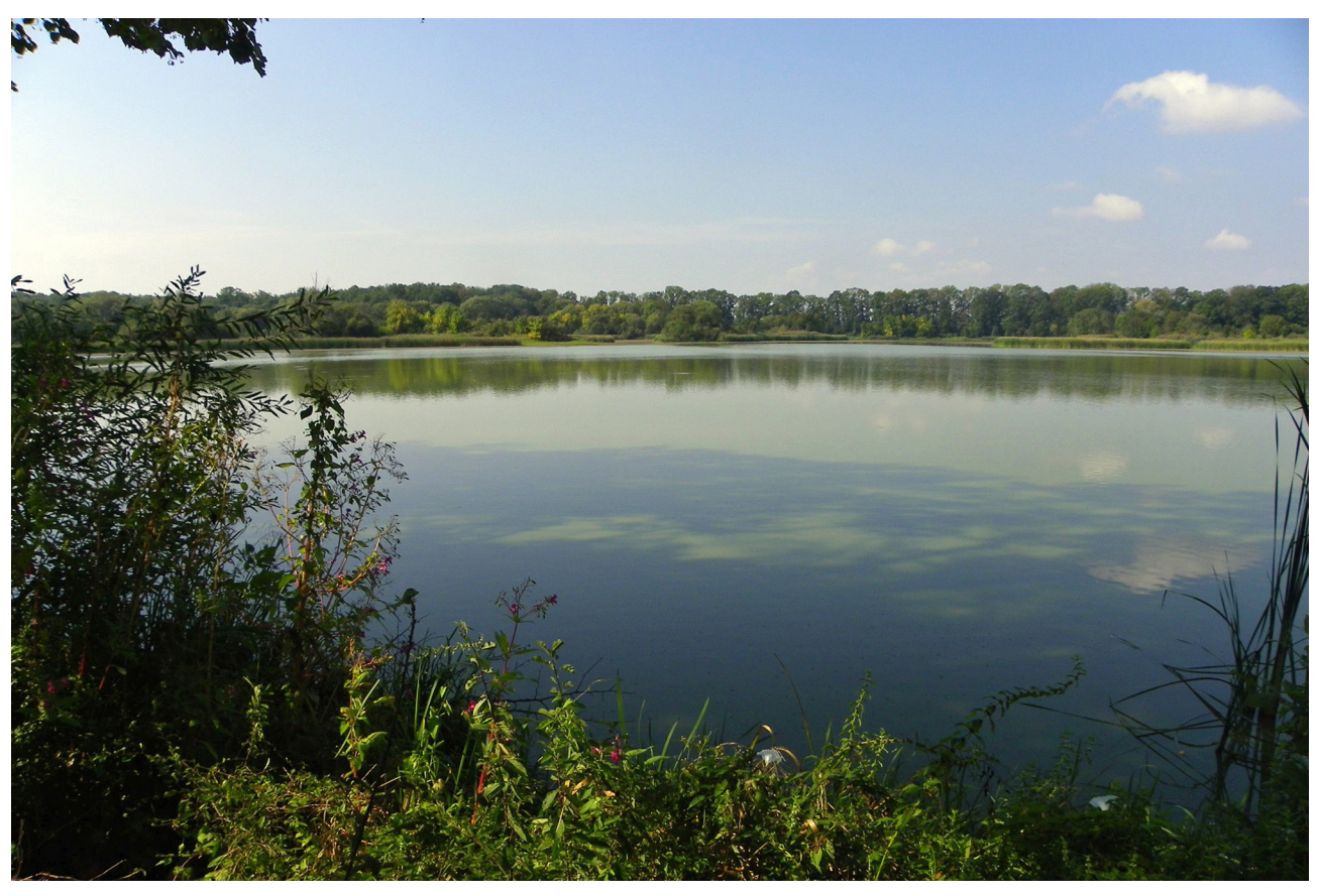
Fig. 8. Horní Bartošovický rybník Pond.