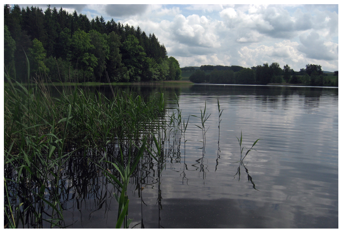
Fig. 7. Tuksa Pond.