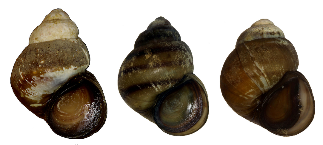
Fig 2. Viviparus acerosus from the Švihov dam reservoir.