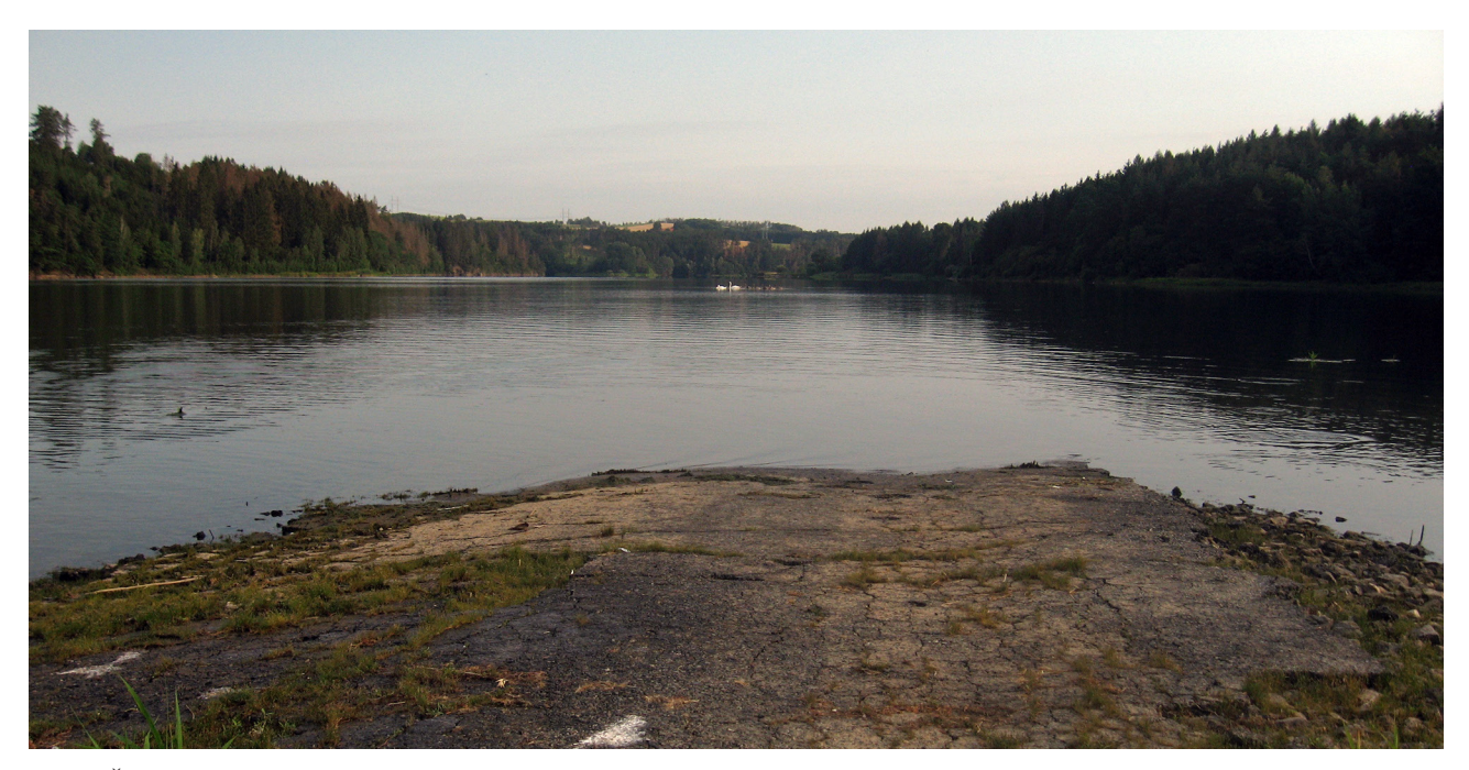
Fig. 6. Švihov dam reservoir.

Fig. 5. Accumulation of fresh empty shells of V. acerosus at the Horní Bartošovický rybník pond (Silesia).