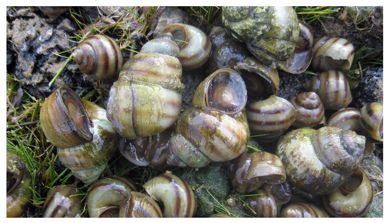
Fig. 4. Live specimens of V. acerosus collected at the Švihov dam reservoir.

Fig. 3. Cytochrome oxidase subunit I (COI) maximum likelihood tree; bootstrap supports and Bayesian probabilities and GenBank numbers were given