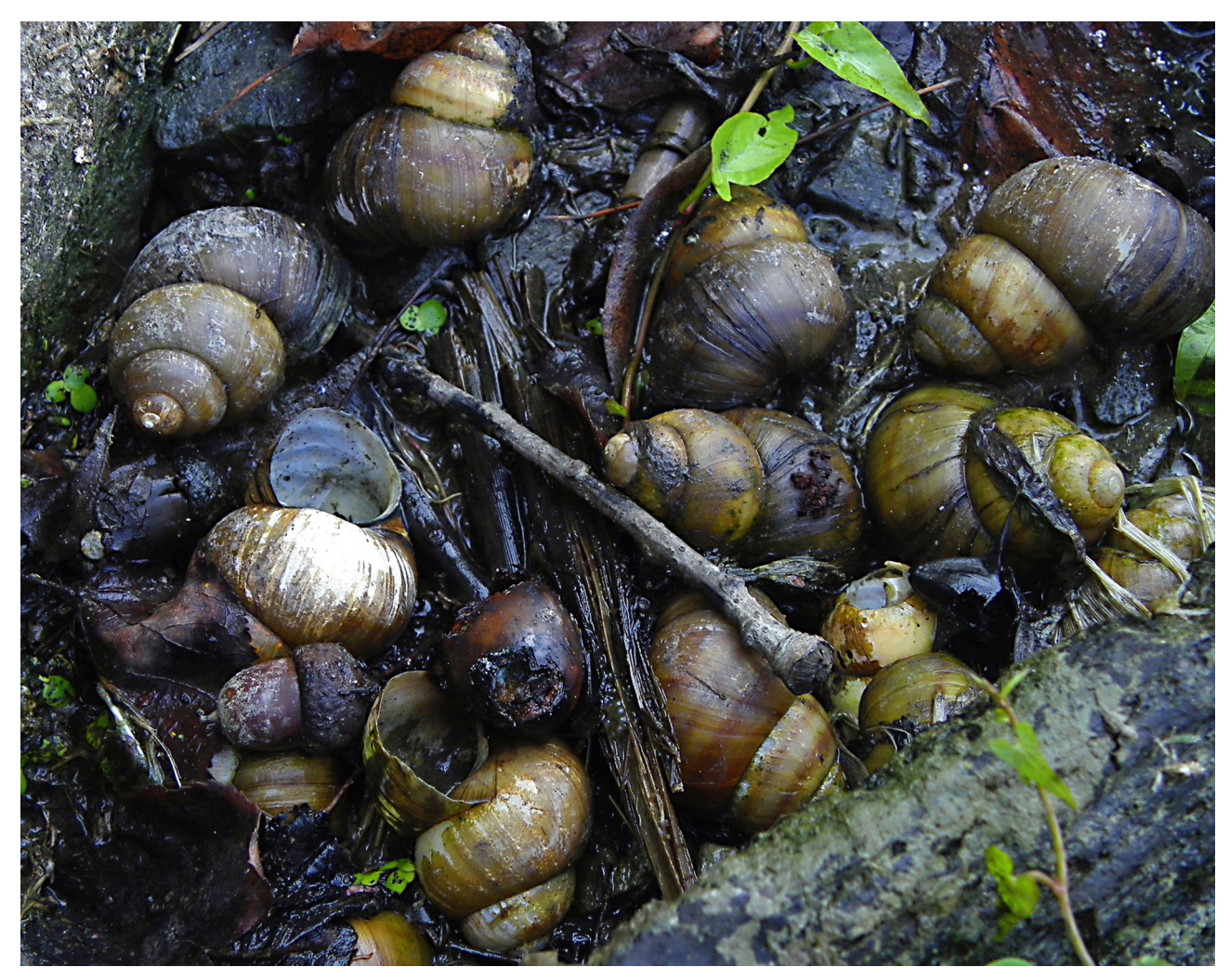
Fig. 5. Accumulation of fresh empty shells of V. acerosus at the Horní Bartošovický rybník pond (Silesia).