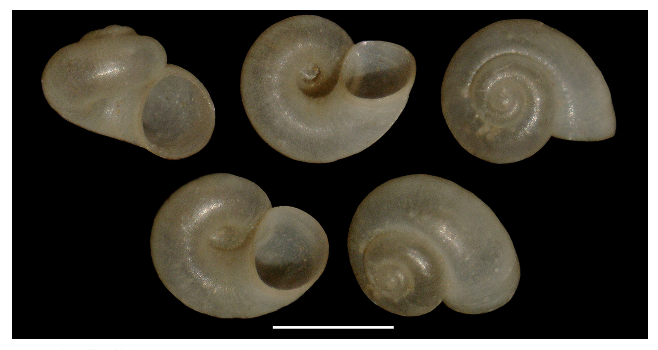
Fig. 1. Salaeniella valdaligaensis n. gen. n. sp. (MZB/holotype). Scale bar 1 mm

Etymology . The name Salaeniella refers to the Cantabrian tribe of the Salaeni, who occupied the middle area of the Saja river basin.