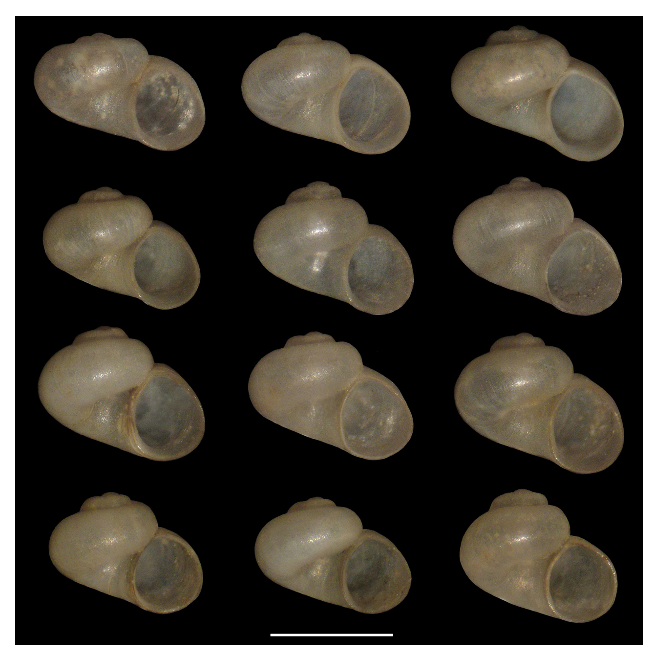
Fig. 2. Salaeniella valdaligaensis n. gen. n. sp. (CSQ and CRC/paratypes). Scale bar 1 mm

on average slightly more than 1 mm; shell valvatiform, opaque, smooth with some growth lines; spire less raised, formed by rather rapidly growing 3.0 rounded whorls; last whorl gradually dilated, near aperture neither ascending nor descending on shell wall; aperture prosocline, ovate, however, palatal and parietal border forming a rounded angle, margin of aperture not thickened; aperture proportionally large, as its diameter of on average 0.62 mm is often only slightly less than half of the total shell diameter; with a diameter of around 0.52–0.71 mm and a height 0.49–0.83 mm, the aperture is usually wider than high; ratio aperture : diameter of umbilicus about 1.7–1.9 : 1.