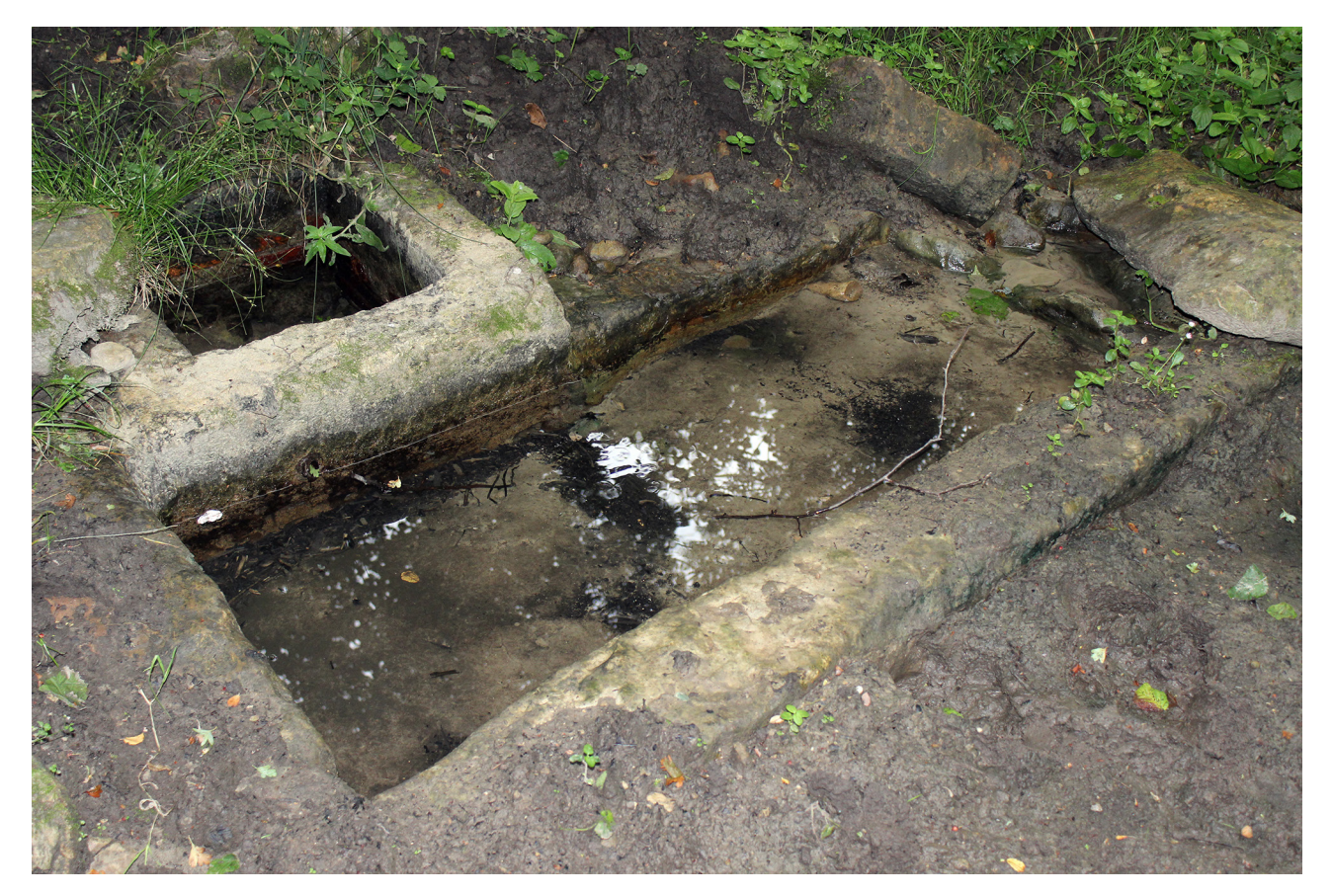
Fig. 4. Type locality of Salaeniella valdaligaensis n. sp.; Spain, Cantabria, Valdáliga, Roiz, Fuente de Casa Caviña, 374 m a.s.l. [30TUN8696]

Penis of dissected male in inactive state hook-like, duct slightly meandering up to the tip of the penis; basal section of penis broad, with some transversal folds, final section of penis fork-like accompanied by finger-like appendix of nearly same length as final section of penis.