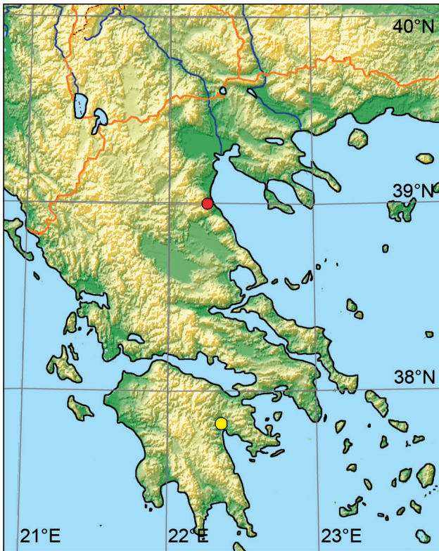
Fig. 17. Map with marked type localities. Yellow dot: Radomaniola tritonum (37°33'07"N, 22°43'03"E); red dot: Grossuana tembii n. sp. (39°58'26"N, 22°38'17"E)

Molecular data: see FALNIOWSKI et al. (2012: 33, fig. 14 G19).