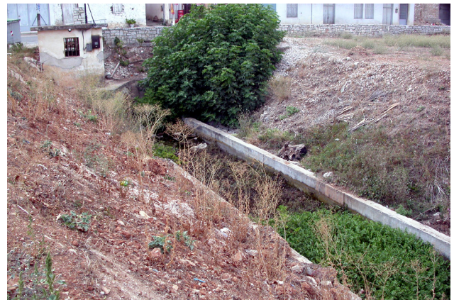
Figs 18–19. Greece, Themi [Temb] Valley, Spring of Athena, type locality of Radomaniola tembii n. sp.

Delimiting characters: In G. tembii n. sp. the parietal border of the aperture is somewhat more inclined and makes the aperture slightly smaller than in R. tritonum ; see Figs 1–5 versus Figs 6–8. In a Bayesian tree based on COI sequences, both species are represented as belonging to different groups (FALNIOWSKI et al. 2012: 33, fig. 14 G19 and G5).