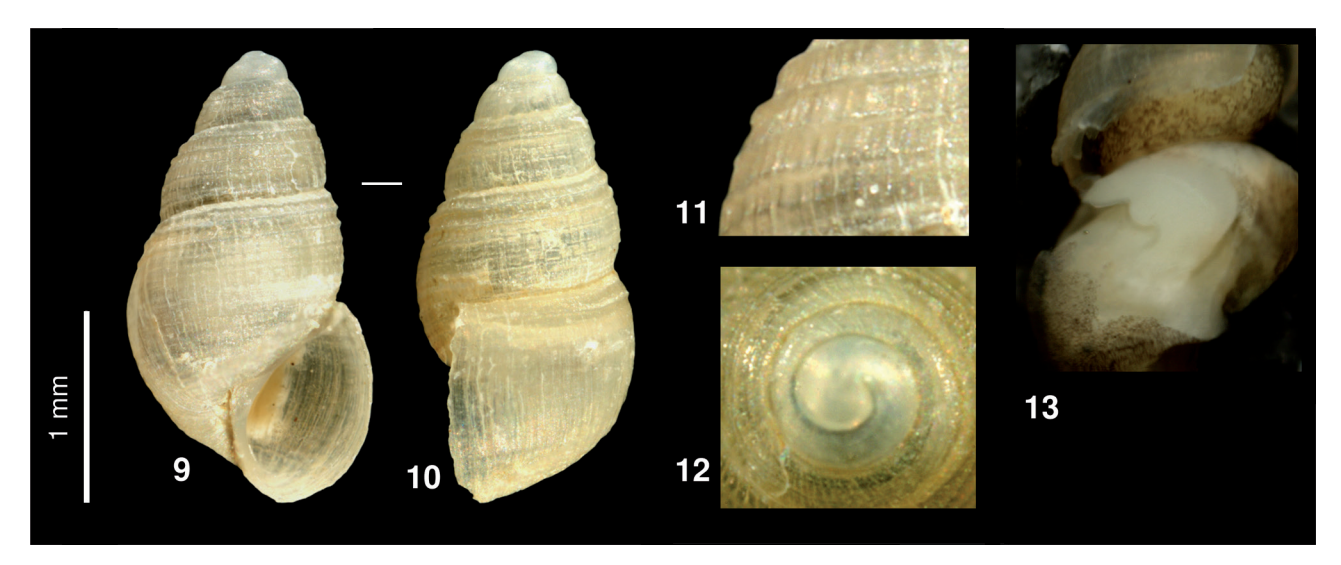
Figs 9–13. Caspia milae n. sp.: 9–12 – shell, holotype, ZMH4887 (9–10 – frontal and lateral view (height of shell 2.4 mm); 11 – detail of shell surface (80×); 12 – apical view (80×)); 13 – male, paratype, BOE 3330 (head with penis exposed through slit mantle)

Remark : We have not seen shells with a thickened palatal and basal margin of the aperture, that is those with completed growth as distinctly visible as in C. gmelinii (Figs 1 and 3).