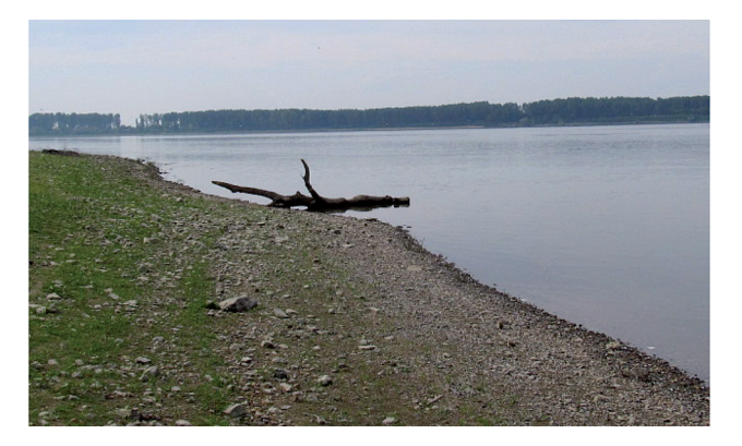
Fig. 7. Type locality: sampling site of Caspia milae n. sp. (Island Vardim, view towards Danube)

The discovery of a new species of Caspia in the Danube will help to improve the insufficient knowledge of the representatives of Caspia .