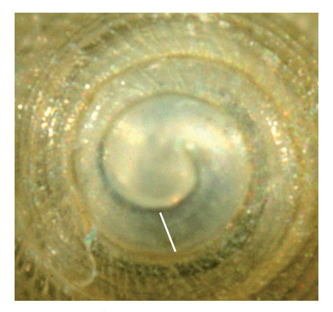
Fig. 14. Caspia milae n. sp. – shell (holotype, ZMH4887: apical view with peristome of protoconch marked (same shell as Figs 9–12); 195×

umellar margin and not narrow and slit-like to closed (ANISTRATENKO 2013: 54, 56); furthermore, in C. milae n. sp. the transition from the columellar to the basal margin is less regularly rounded than in C. knipowitschii . In C. knipowi tschii the protoconch has 1.25–1.30 and its diameter is 0.28–0.35 mm, whereas in C. milae n. sp. the number of whorls is only 1.00–1.20, however the diameter is 0.38–0.42 mm (Table 3). Finally, in the Black Sea region, C. knipowitschii inhabits the deltas of the Dnieper River and the Dniester River. C. milae . sp. was found in a different environment: about 500 km upstream of the Danube estuary.