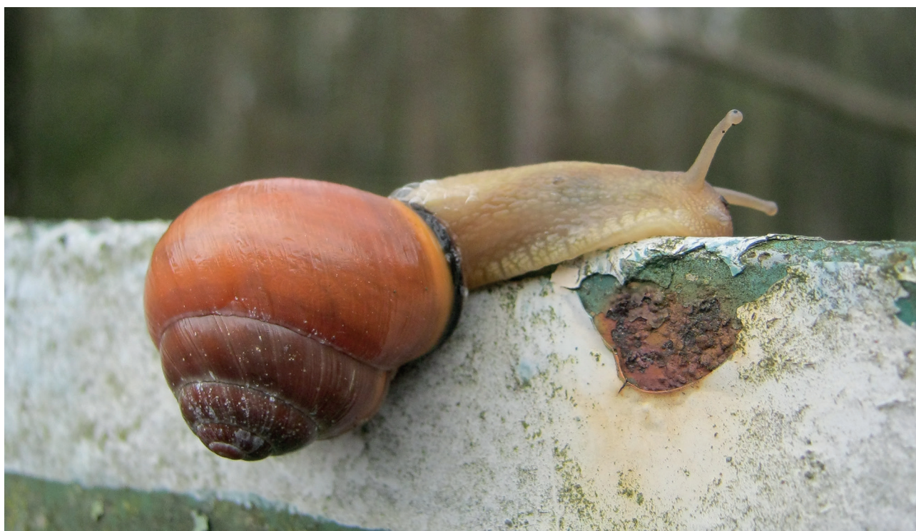
Fig. 2. Cepaea nemoralis , posing on the traffic sign “Hajnówka” in Budy.