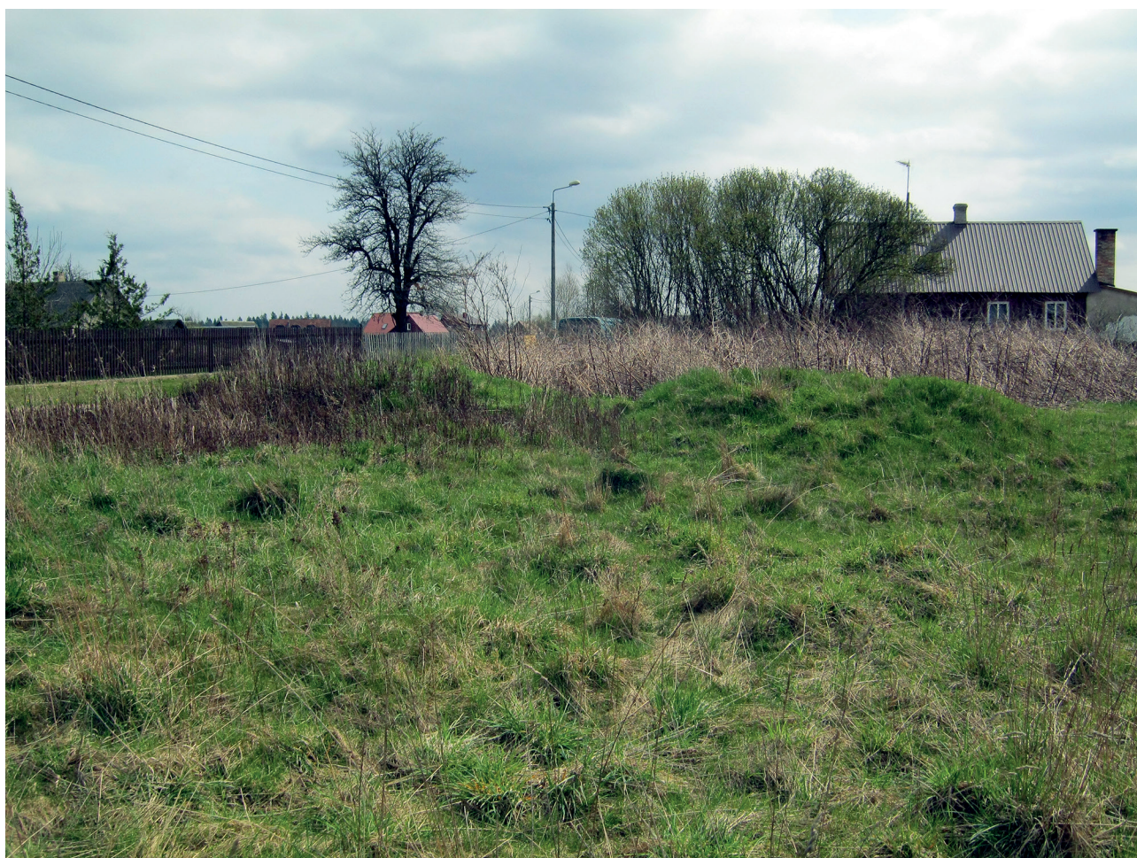
Fig. 3. The locality of C. nemoralis in Budy.