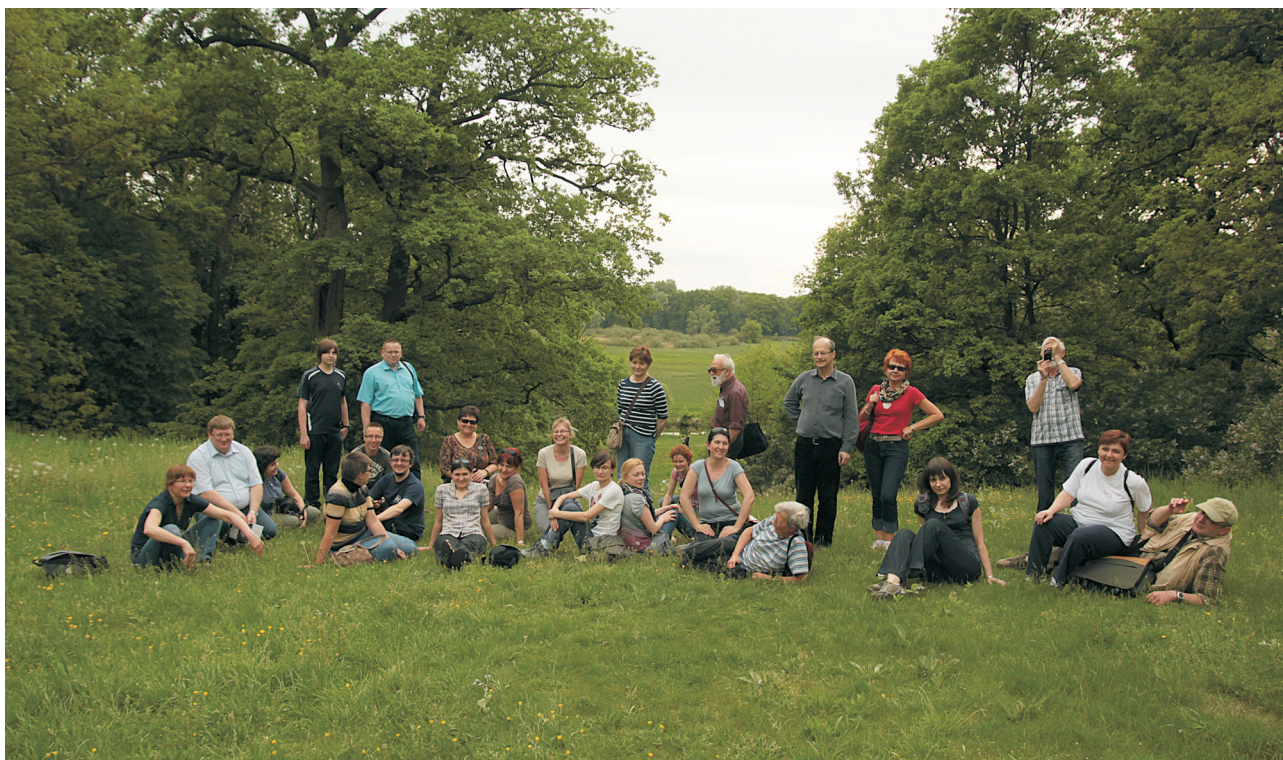
Fig. 2. Some participants during the excursion in Rogalin.

the banquet (Fig. 1). The Seminar excursion (Thursday, 10th), went first to Kórnik with its great old palace and park-cum-botanic garden, with many exotic trees and shrubs, some in flower, and then to Rogalin