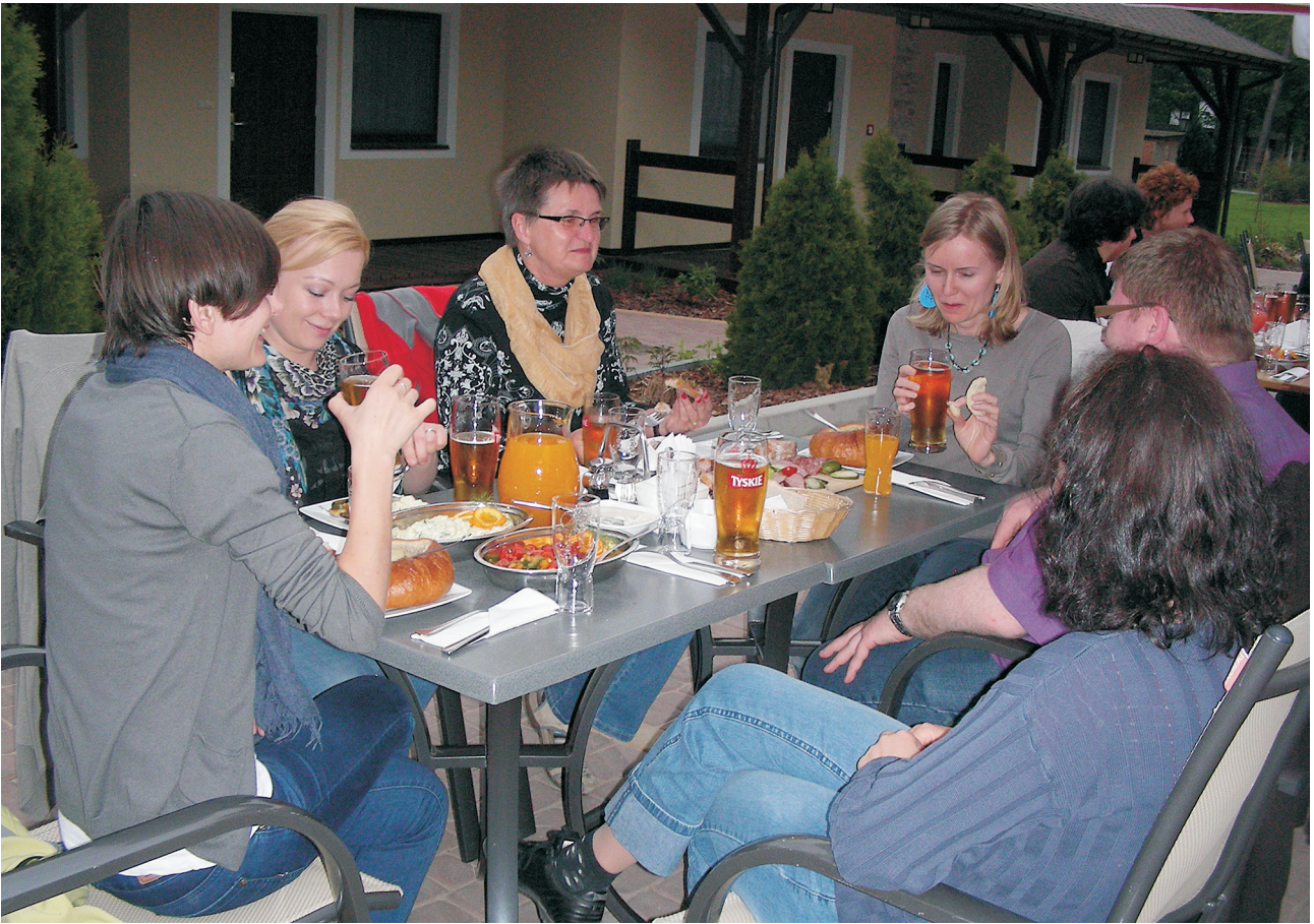
Fig. 3. Grill party.

with its very impressive old oak trees and the Warta oxbows (Fig. 2), and to lunch in a very nice country inn. After the excursion we had a grill party (Fig. 3) with a great variety of meats, but also vegetarian dishes, plus things to drink (galore!). The last day was another spent in the sessions and then we had to say goodbye.