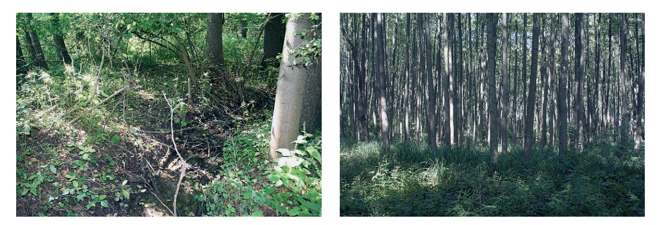
Figs 2, 3. Fragments of the habitat of the Muszkowice population of Aegopinella epipedostoma