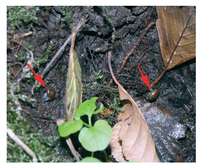
Fig. 1. Individuals of Aegopinella epipedostoma in their typical microhabitat in Muszkowice

Aegopinella epipedostoma (Fagot, 1879) is a montane species whose distribution is rather incompletely known due to frequent confusion with Ae. nitens (Michaud, 1831). It is known from the Pyrenees and their northern foothills where it is common, from