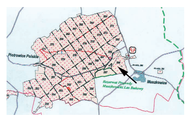
Fig. 4. Map showing localition of the study plot (arrow)

The abundance of individual age classes in consecutive months is presented in Figs 5-12. The youngest age class (1.1-1.5 whorl) appeared in July and was still present in September. The breeding season included these three months (Fig. 5). Age class II (1.6-2.0 whorls) appeared in August and September (the spring hatchlings) (Fig. 6). The next class (III: 2.1-2.5 whorls) was first observed in September, was present in October and became the most abundant in November. The juveniles of this size probably wintered over (Fig. 7). Age class IV (2.6-3.0 whorls) was present from May till November (Fig. 8). The spring individuals of this age class were probably last year hatchlings. Class V (3.1-3.5 whorls) was the most abundant in August, September and October (Fig. 9). Individuals of class VI (3.6-4.0 whorls) were less abundant in June