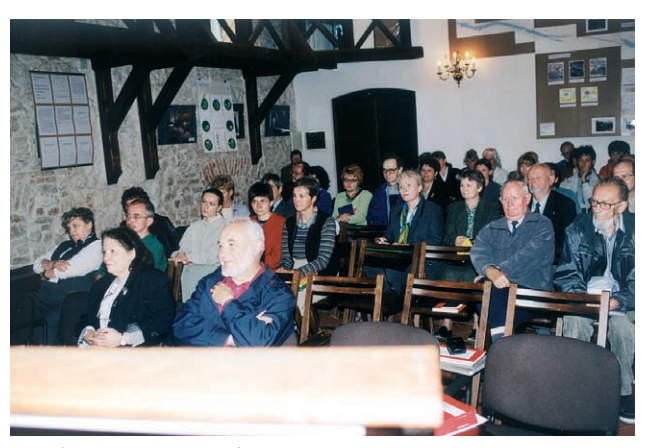
Fig. 3. Listening to a lecture

The General Assembly of the Association of Polish Malacologists decided that the next Seminar (18th,