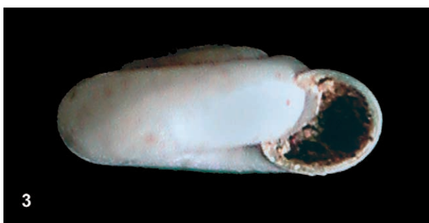
Figs 1–3. Vitrea vereae n. sp., holotype: 1 – top view (23×), 2 – umbilical view (23×), 3 – front view (22.5×); photo J. STOILOV

angle. The aperture is crescentic and flattened from below. The underside of the shell is slightly convex. The umbilicus is wide and perspective, of ca. 1/3 shell width, with all the whorls visible inside.