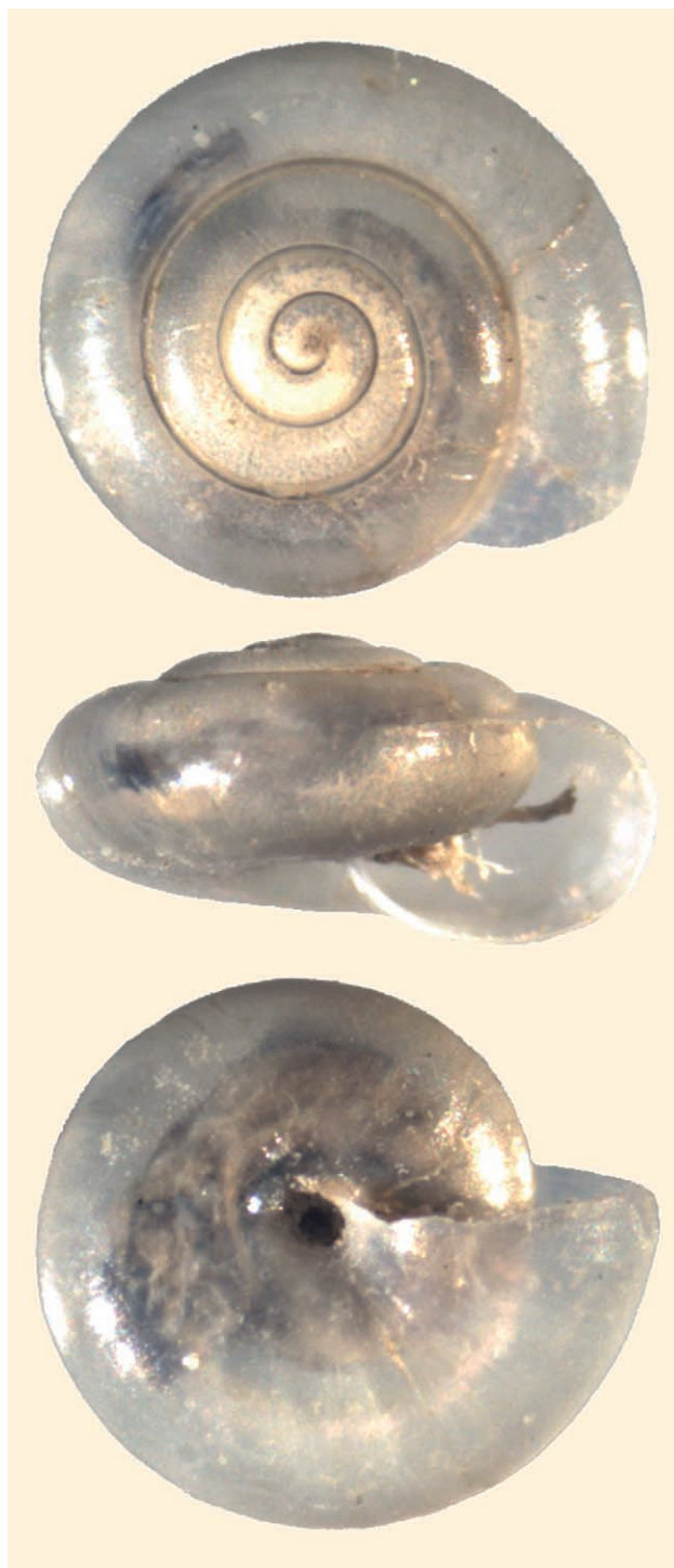
Fig. 2. Shell of Oxychilus hydatinus from the cemetery in Kalinkovo.