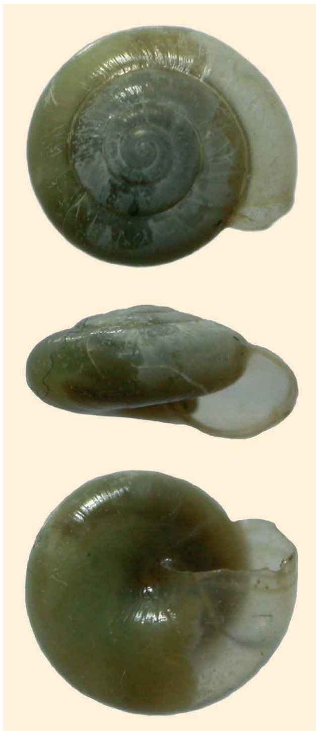
Fig. 1. Shell of Oxychilus hydatinus from Ondřejský Cintorín cemetery.