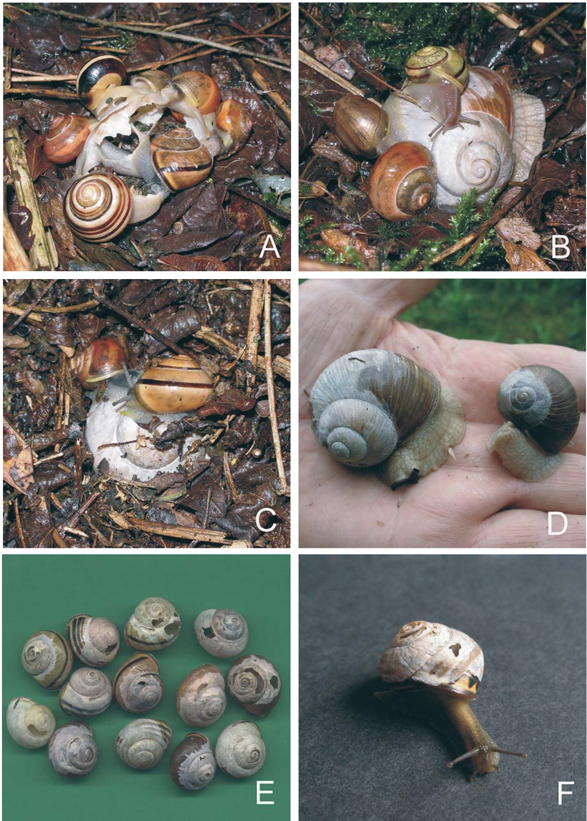
Fig. 1. Shell predation and cannibalism in Cepaea nemoralis . A – C. nemoralis gnawing at the remnants of a Helix pomatia shell; B – C. nemoralis gnawing at a shell of a live H. pomatia ; C – C. nemoralis gnawing at a shell of H. pomatia immobilised during egg-laying; D – adult and juvenile H. pomatia with characteristic signs of having been gnawed at by other snails; E – shells of C. nemoralis damaged by conspecifics; sealing of shells from inside can be seen (all snails were alive at collection); F – C. nemoralis individual with a perforated shell