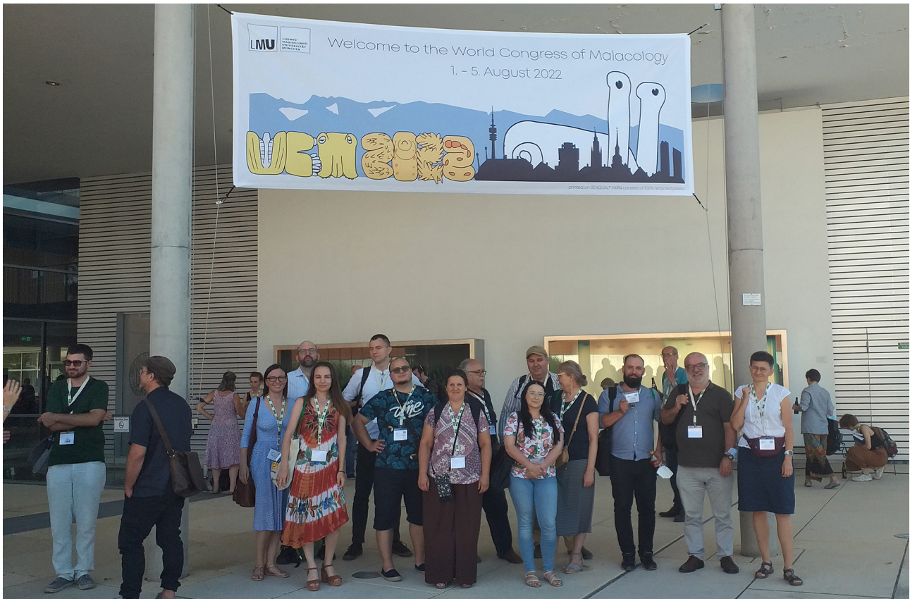
Fig. 5. Polish malacologists at WCM2022.

their way here – incl. jewellery, clothes, figurines, gadgets ... of course, everything in the shape of molluscs or decorated with malacological motifs. The