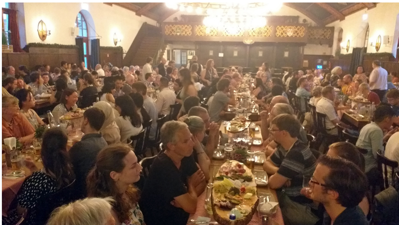
Fig. 4. A farewell feast in Bavarian style.

The organisers, based on the applause of the audience, awarded the participants with prizes for the best performances. Another interesting event was the auction. The organisers put up for auction many of the latest malacological books. Various items donated by participants of the congress have also found