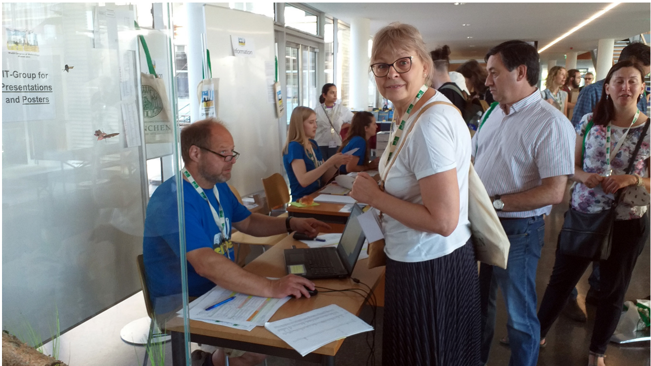
Fig. 1. Registration desk.

took part in the competition for the best presentation. Finally, the 3 best talks and the 3 best posters were awarded prizes. But Unitas Malacologica had one more surprise for them. All the winners may participate in the next WCM (3 years hence) without any fee.