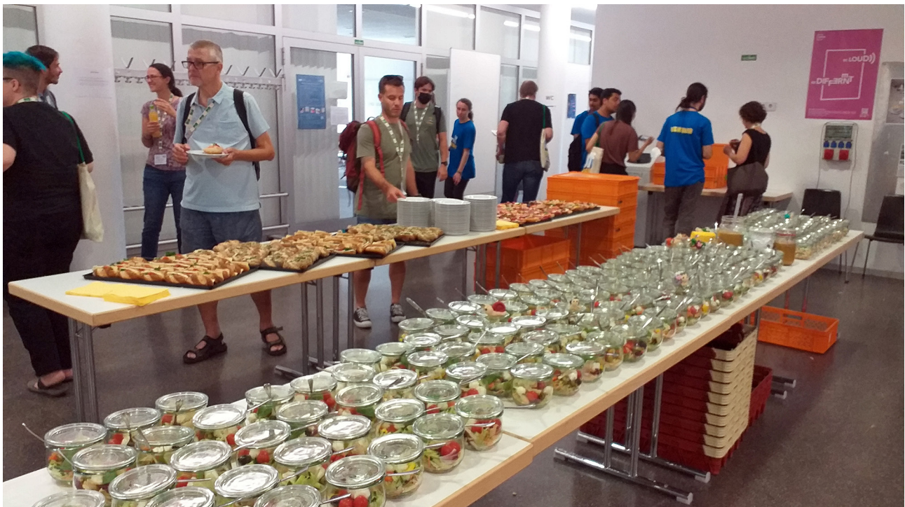
Fig. 6. Delicious snacks are waiting...

total proceeds from the auction fed the scholarship fund for travel grants for young scientists for the next WCM.