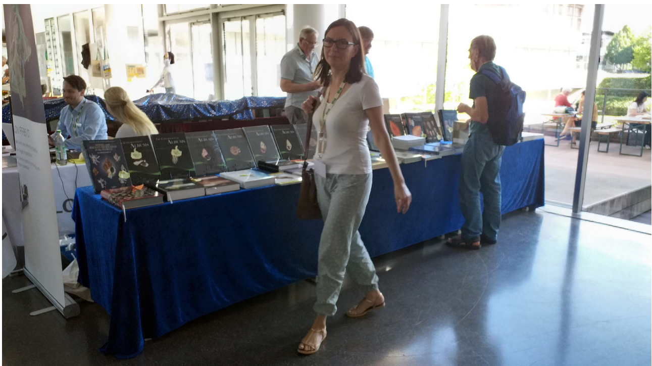
Fig. 2. Sponsors' stand with books.

Apart from traditional scientific sessions, it was possible to take part in accompanying events. One of them was Science Slam. Any participant could submit their speech in this unusual session and present themselves, their research and plans for the future. There were no rules here, just a limited time – 6 minutes! Creativity was appreciated and certain-