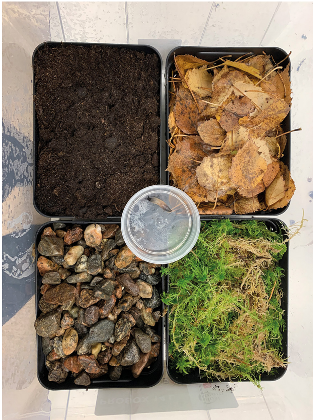
Fig. 1. One of five replicate arenas used for testing egg-laying habitat selection of Kryniockillus melanocephalus . Slugs were offered four different substrates (potting soil, birch leaves, gravel and sphagnum moss) to lay their eggs. A slug individual is visible in the circular cup in the centre, where slugs were released at the beginning of the experiment

again. Dead slugs ( n = 10 during the three days) were replaced with new slugs of similar size (and thus 60 slugs participated in the experiment in total).