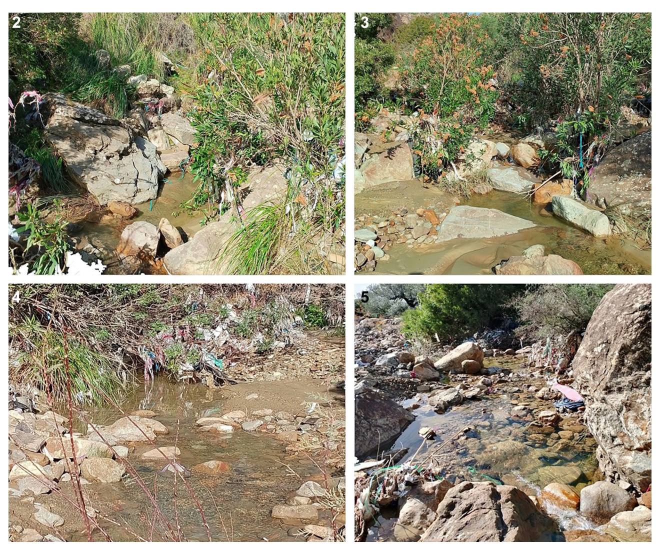
Figs 2-5. Different habitats sampled

The observation of juveniles attaching to older individuals of the same species for dispersal is rare in the literature. One documented case involves aphid nymphs attaching to conspecific adults to locate food