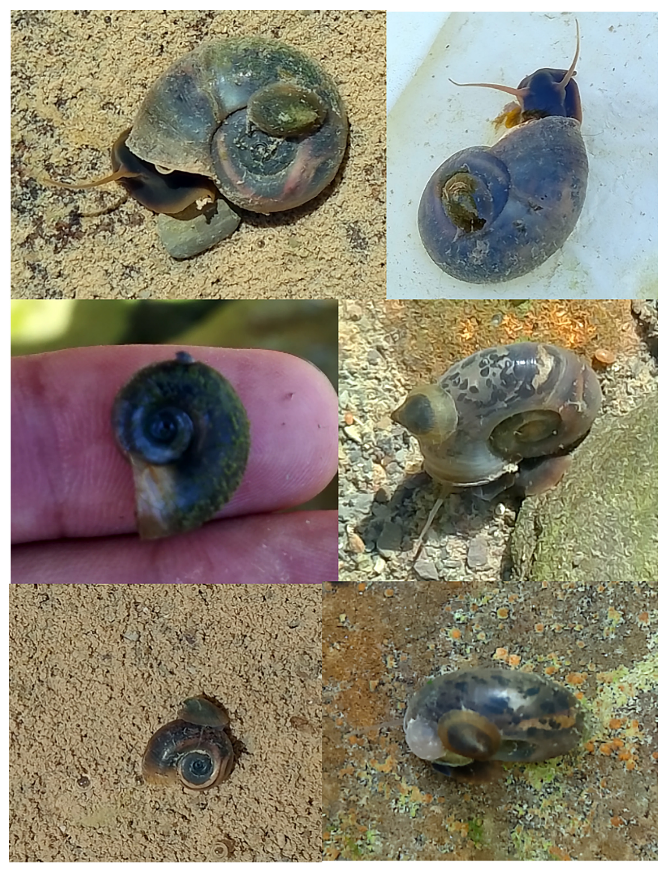
Fig. 6. Different observations of phoresy between Ancylus fluviatilis and Planorbarius metidjensis