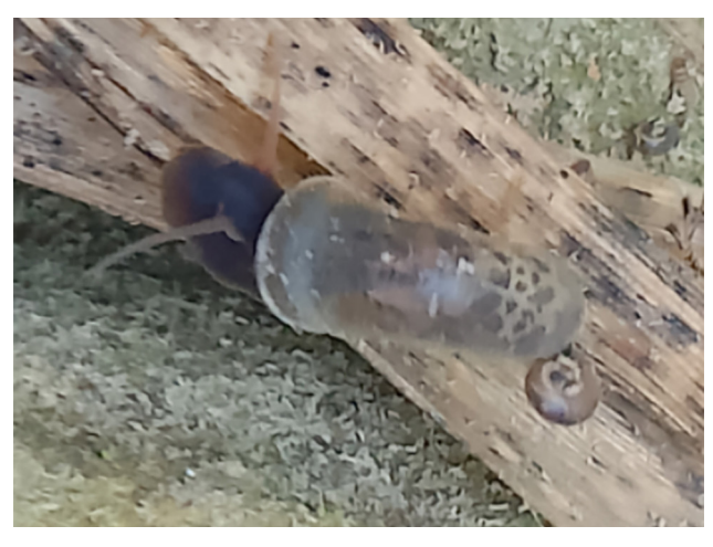
Fig. 7. Transport of Planorbarius metidjensis by a conspecific

In conclusion, our observations suggest the possibility of phoresy between Planorbarius metidjensis and Ancylus fluviatilis in Algerian freshwater habitats and a possible example of intraspecific phoresy in P. metjidensis . Future work should further test the hypothesis that A. fluviatilis uses P. metidjensis as a host for the purposes of dispersal. This interaction would suggest a complex ecological relationship between the freshwater molluscs and underscores the mechanisms and consequences of phoresy in aquatic ecosystems.